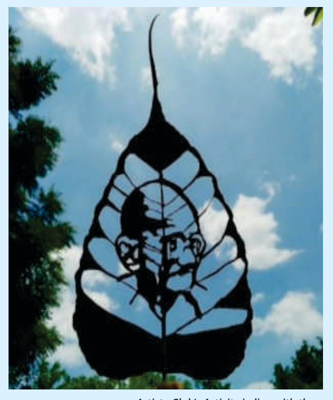
Artista Club's Activity in line with the Azadi ka Amrit Mahotsava