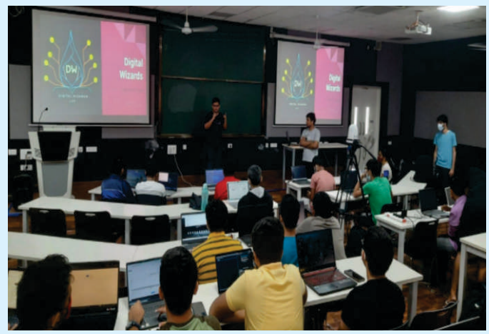
Digital Wizard organised by Technical Club