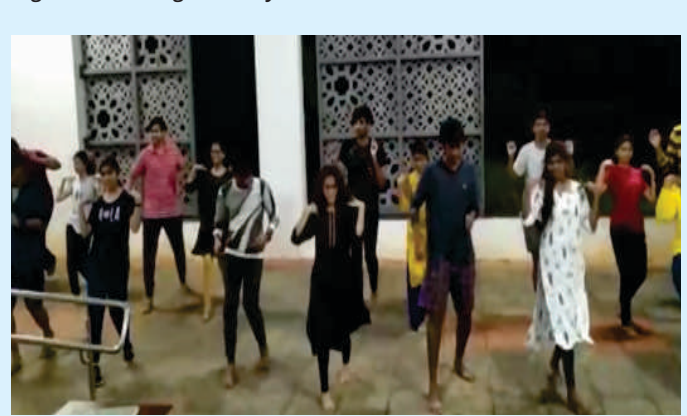
Dance Club at IIT Tirupati